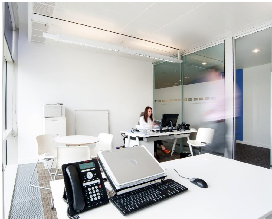
Example office suite, not actual space

Make the right impression with a relatively small office found within an exciting business park, entertain your clients in one of the communal break-out areas, meeting rooms (additional charge) and on-site restaurants.