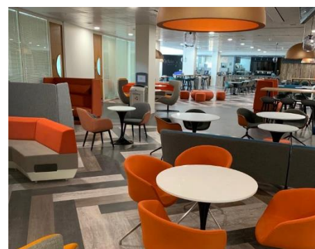
A range of restaurants and cafes on the Park offering a wide menu including light snacks, lunches as well as hot & cold drinks.