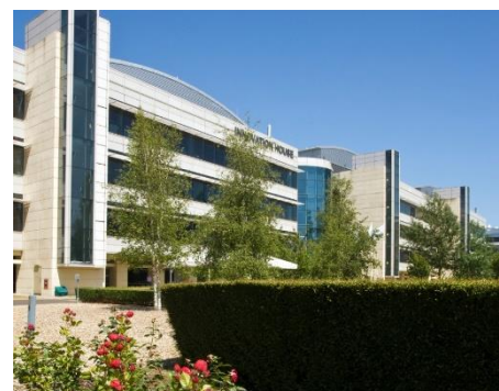
Make an impression with your clients with prestigious setting.